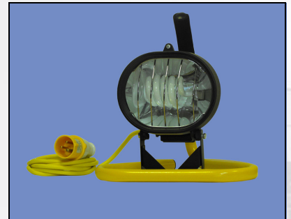
Portable - Part Number S060741

The SpiraLite is available in single and twin versions. The single can be supplied on a carry frame or on a cradle bracket for tripod or wall mounting or scaffold mounting with an additional bracket. The twin version is designed for tripod mounting or scaffold mounting with an additional bracket. All versions are pre-wired with an input lead fitted with a 16A 110V plug and come complete with lamp. The overall assemblies are rated to IP44 and are suitable for indoor or outdoor use.