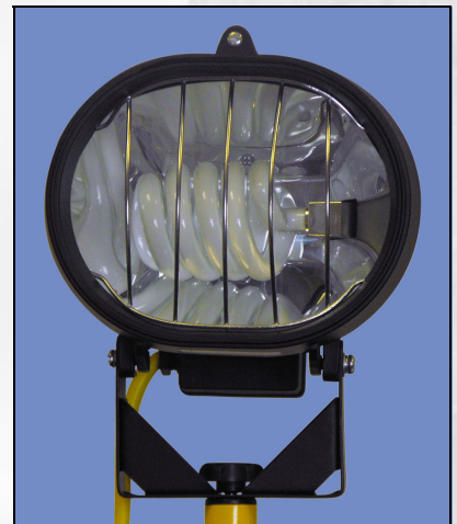
Tripod / Wall Mounting - Part S060742